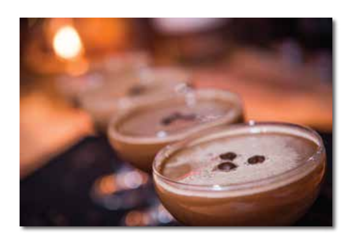
ADDITIONAL OPTIONS & RECEPTIONS